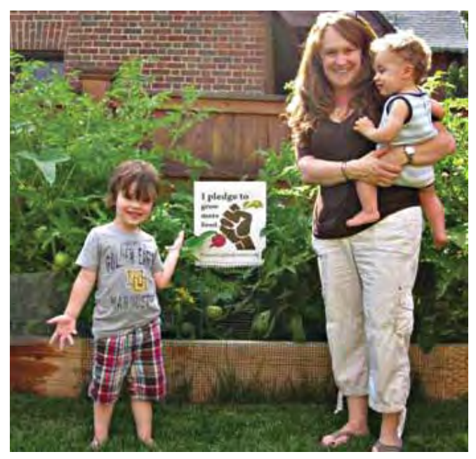
This youngster is proud, and rightly so, of their garden's sign: I pledge to grow more food