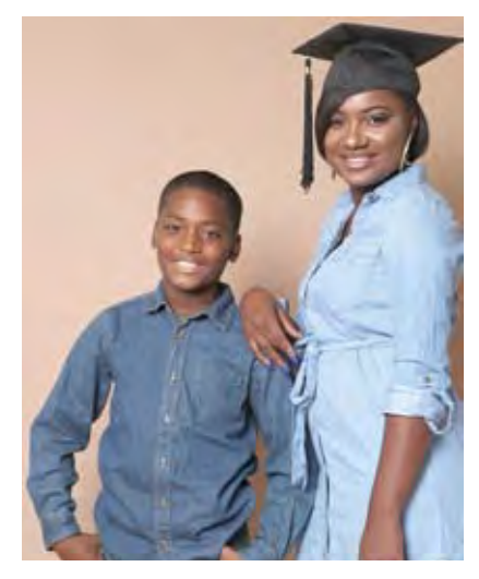
Every issue we publish profiles written by our scholarship winners. In our June edition, we'll be introducing our 2019 winners

My life started with my son, when I was 16 years old.